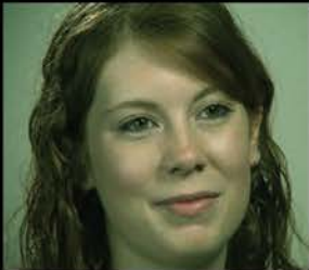
Low CRI LED

Low CRI LED lights have a very narrow color spectrum and are typically centered in the green range. No amount of color correction can bring back the full range of skin tones with low CRI lights.