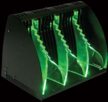
World's First Single Light Green Screen Fixture