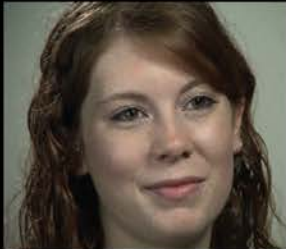
High CRI MicroBeam