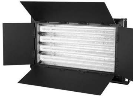
FL-220AW (1000 watt)