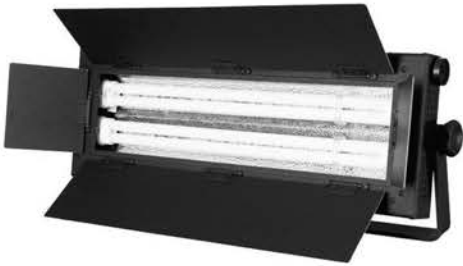
FL-220AW (1000 watt)